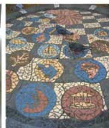
Community Heritage Mosaic