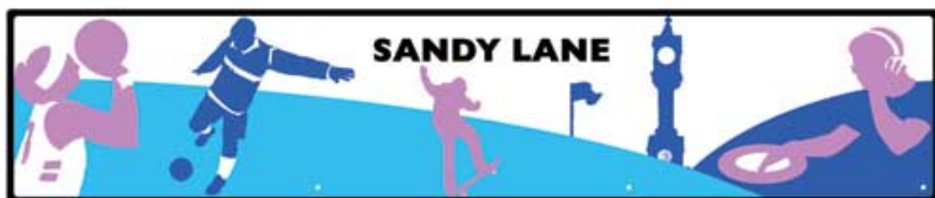
Initial design for subway signage by Van Nong

The Lancashire Hill subway is currently unattractive and perceived as unsafe by many because of poor lighting and lack of natural surveillance. The aim of this project is to make the subways an attractive and less threatening public amenity. This project is the first of three phases to improve the area.