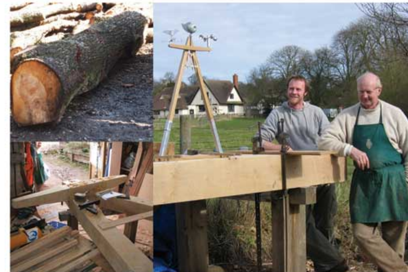
Artwork manufacture at Bowbells joinery using Sandon Estate green oak

The collaboration with local manufacturers and suppliers was an eye-opener to the skills and resources that existed in close proximity to the site at Apedale. The artworks were designed to minimise use of the earth's finite resources and maximise sustainable art practice. The issues encountered on this project spring-boarded Chrysalis Arts into reviewing its own practice and to question that of other artists and arts organisations and was influential in the development of the Slow Art Trail.