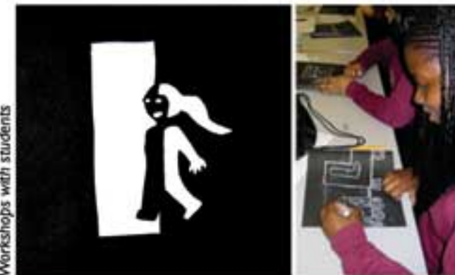
Workshops with students

'A Change in the Weather' utilises the wind to power its rotating 'weather' parts and sound its eight directional acoustic wind pipes. Manufactured locally with Staffordshire green oak and stone and including stainless steel details, the landmark sculpture will be installed on a prominent hill-top near the site of the new Energy Centre that is planned to be built soon at Apedale.