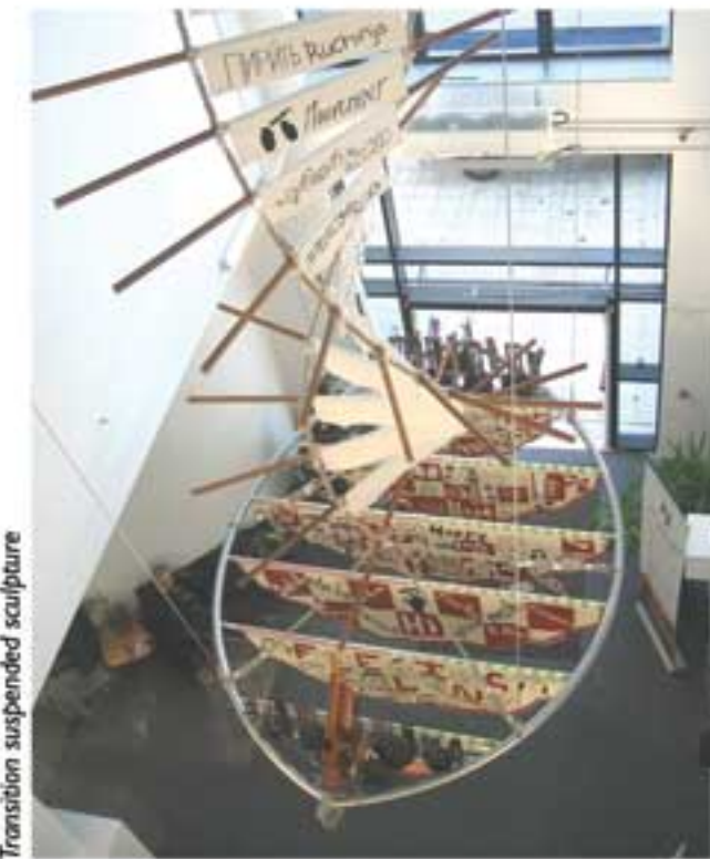
Transition suspended sculpture