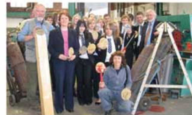
School visit to Metanodic who manufactured the waymarkers locally

The waymarkers included artwork plaques made in school workshops and cast at a local foundry. These were fitted to locally grown green oak posts and installed by volunteer rangers. The landmark kinetic artwork,