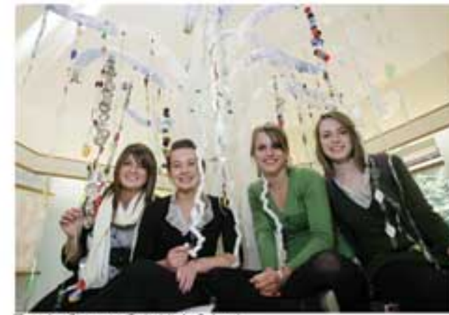
Tree by Skipton Girls High School

ation in the centre of the Exhibition Centre, giving the students the opportunity to create a site-specific work.