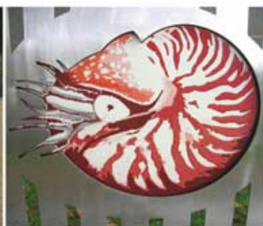
Seat detail: vitreous enamel insert